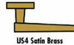
US4 Satin Brass